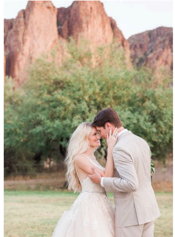
PHOTOGRAPHY -April Maura