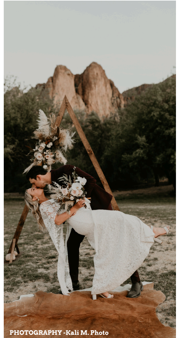
PHOTOGRAPHY -Kali M. Photo

Beer & Wine Beverage Packages are NOT available with this Ceremony only package. Please see the 4 hour & 6 hour option.